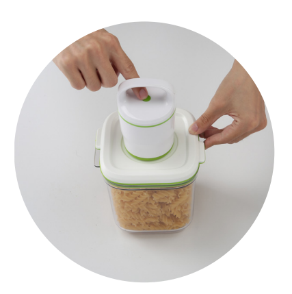
SPEED-UP MARINATING PROCESS