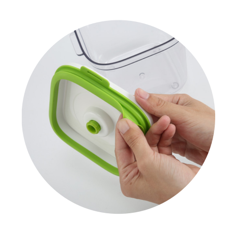
DISHWASHER & FREZZER SAFE