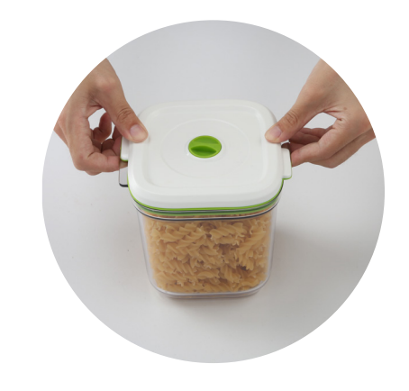
IDEAL FOR BOX LUNCH